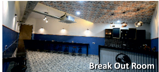
Break Out Room